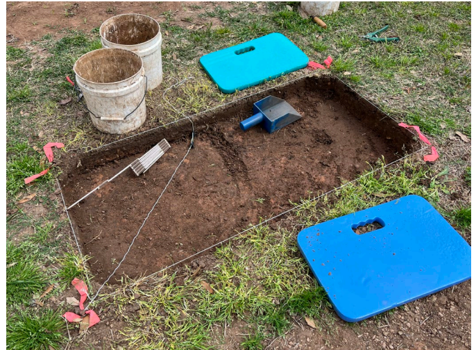
Here's the same pit after we've completed the first 4" level. The folding rule and string with line level help insure we dig to the correct depth.