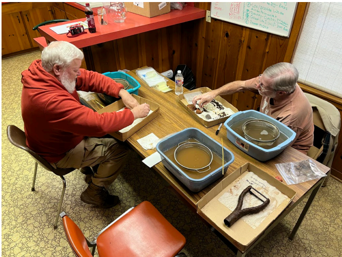
On rainy days, we work in the archeology lab rather than at the excavation site. Tubs of water, strainers and toothbrushes are used to clean artifacts from the dig site.