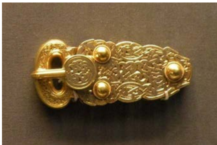
Great Gold Buckle