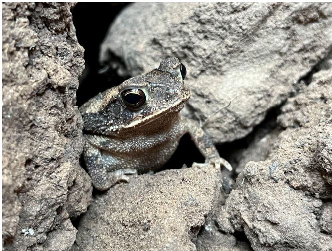
We usually find some of the local wildlife hanging out in the pits in between excavations.