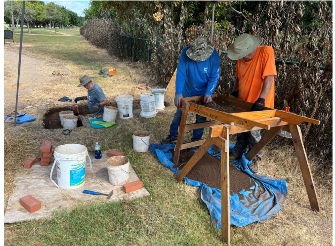
Members from the Houston Archeological Society stopped by recently to visit and to help with the excavation.