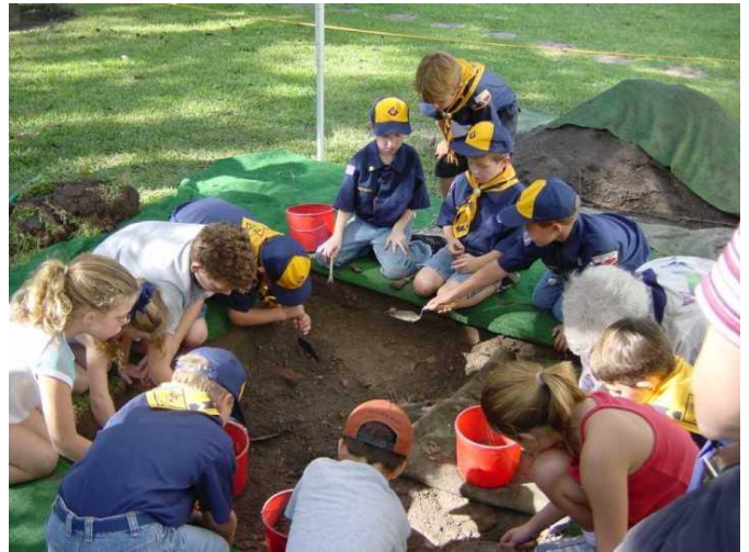
Old Prairie Home Site, George Ranch, 2002