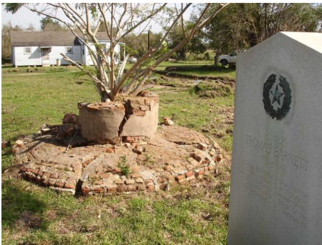
Barnett Plantation Site, 2006