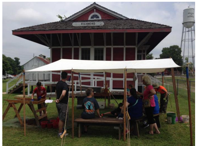
Decker Park Site, 2016