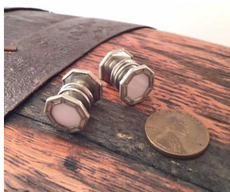
Cufflink from current archeological site (left), similar vintage cufflinks on eBay (right).

Recently, an interesting artifact, seen in the above left image, was found in one of the excavation pits. At first glance it looked like a button inset with mother of pearl. The letters M and A could be seen on the back. We had never seen a button shaped like this before. After a quick search on the internet, it turned out it wasn't a button at all. In fact, what was found was actually half of a cufflink. Originally, two halves would have snapped together to form a cufflink. In 1918, the company Baer & Wilde introduced the KUM-A-PART Cuff Buttons. They were very popular throughout the 1920s. It's a very cool find, but we were hoping to find more artifacts from the mid-1800s. We never know what we'll find next!