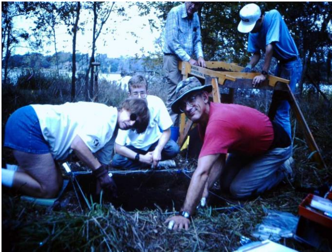
Smithers Lake Site, 1995

Today, the society continues to investigate archeological sites in the county. Presently, FBAS is working on a site close to downtown Richmond. It's a great opportunity for new volunteers to join and to be part of the society's mission to investigate and preserve archeological sites. There are many opportunities to be a part of the ongoing research. You can research county records, get dirty digging in the field, conduct lab work or learn how to operate high tech sensing equipment, such as a ground conductivity meter or ground penetrating radar.